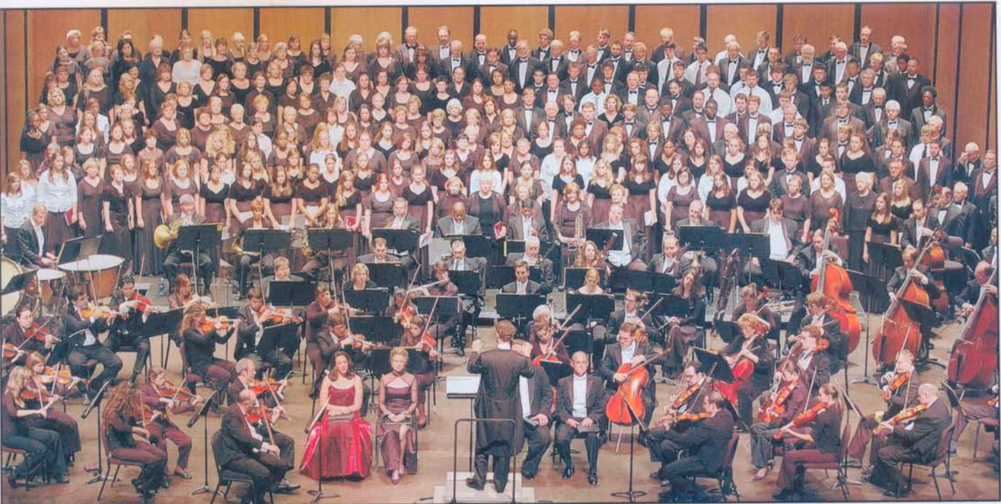
The Huntsville Symphony Orchestra and Community Chorus perform at the Von Braun Center: